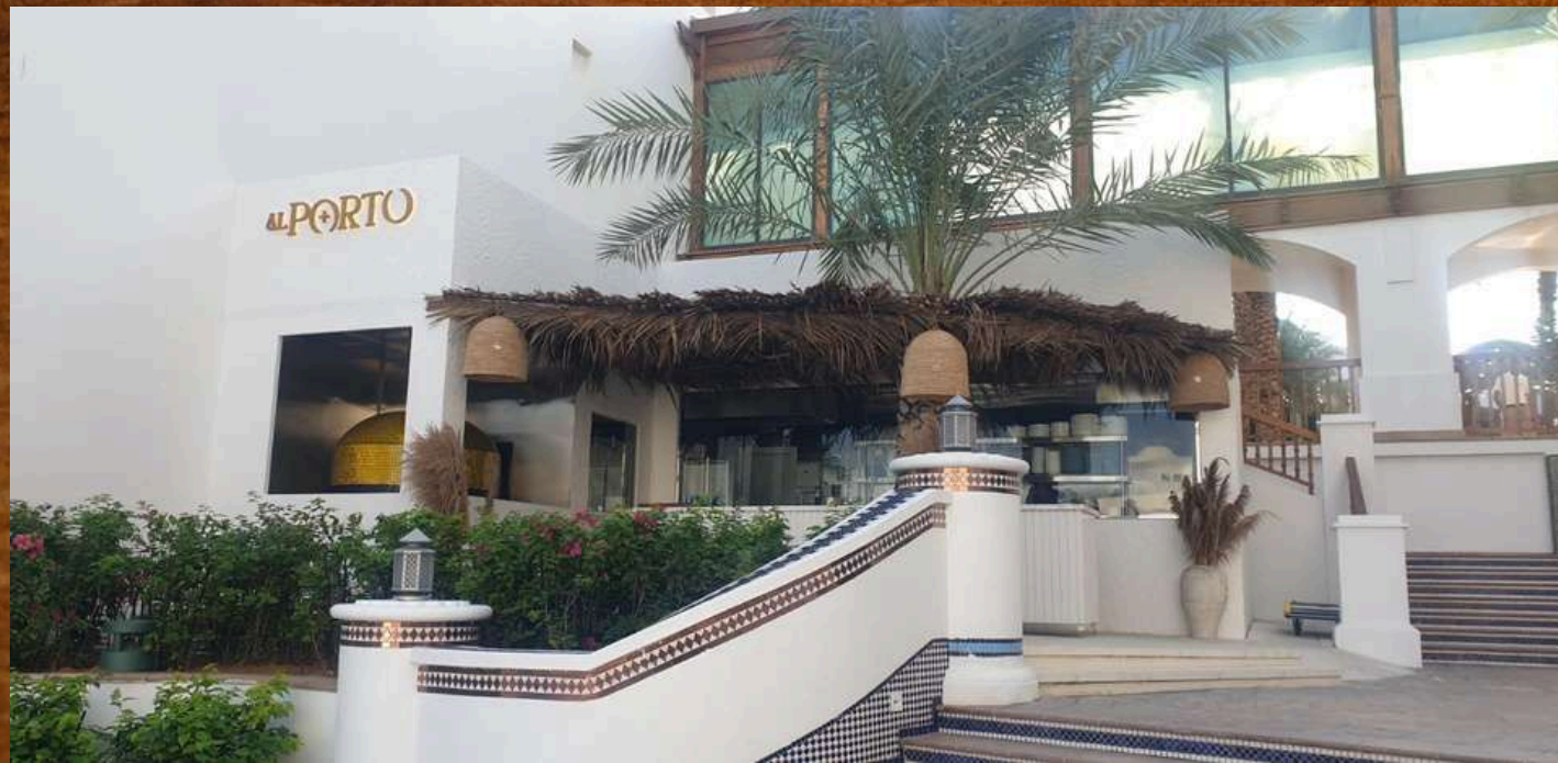
PARK HYATT - DUBAI