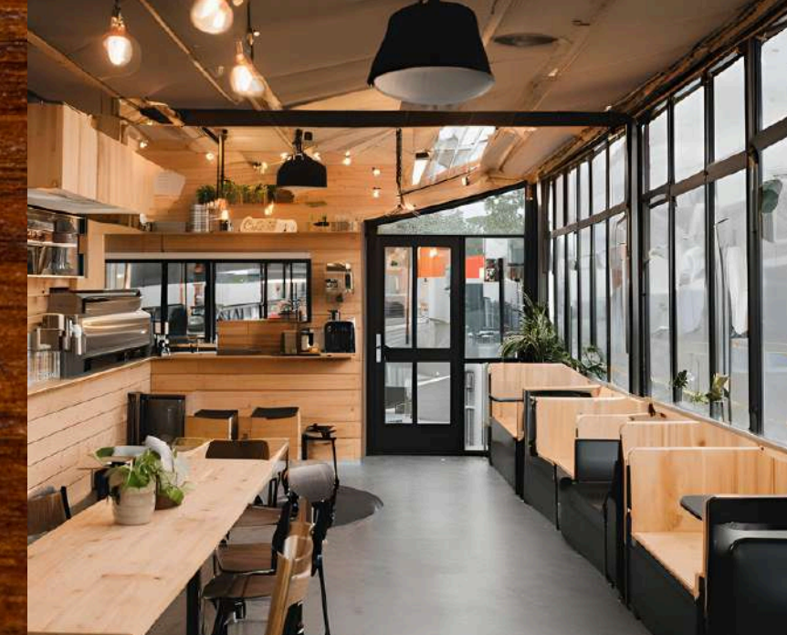
CAFE - UAE