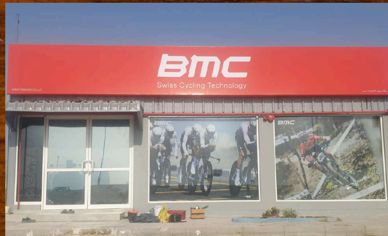
BMC SHOWROOM - UAE