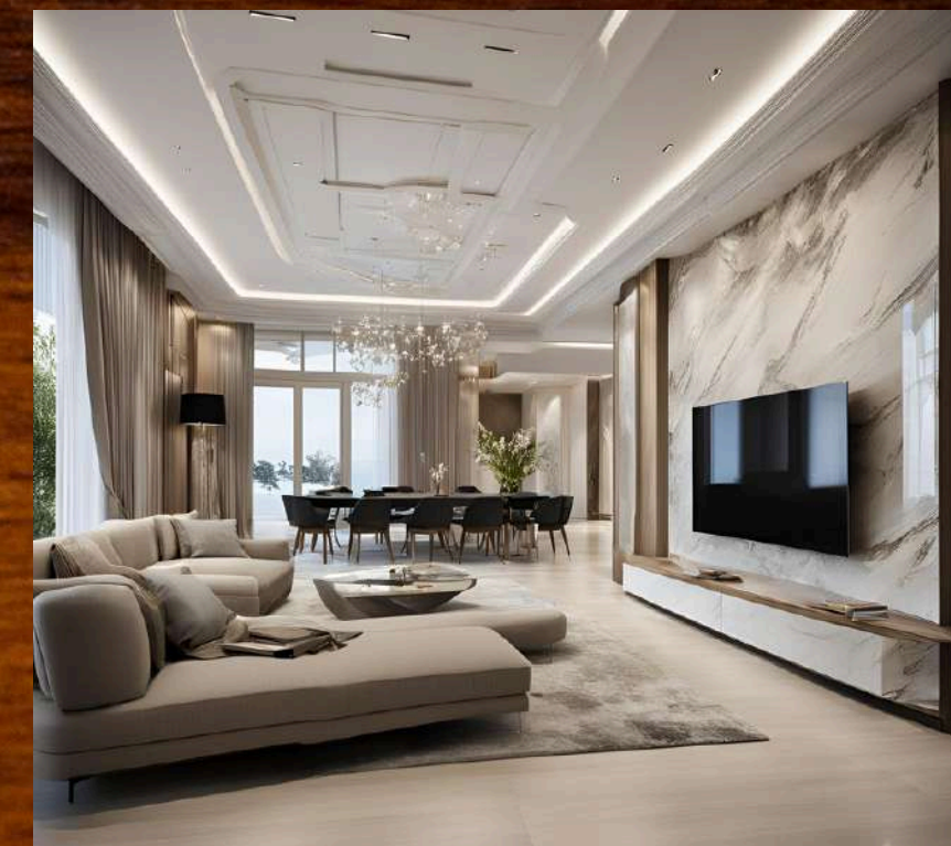
VILLA - UAE