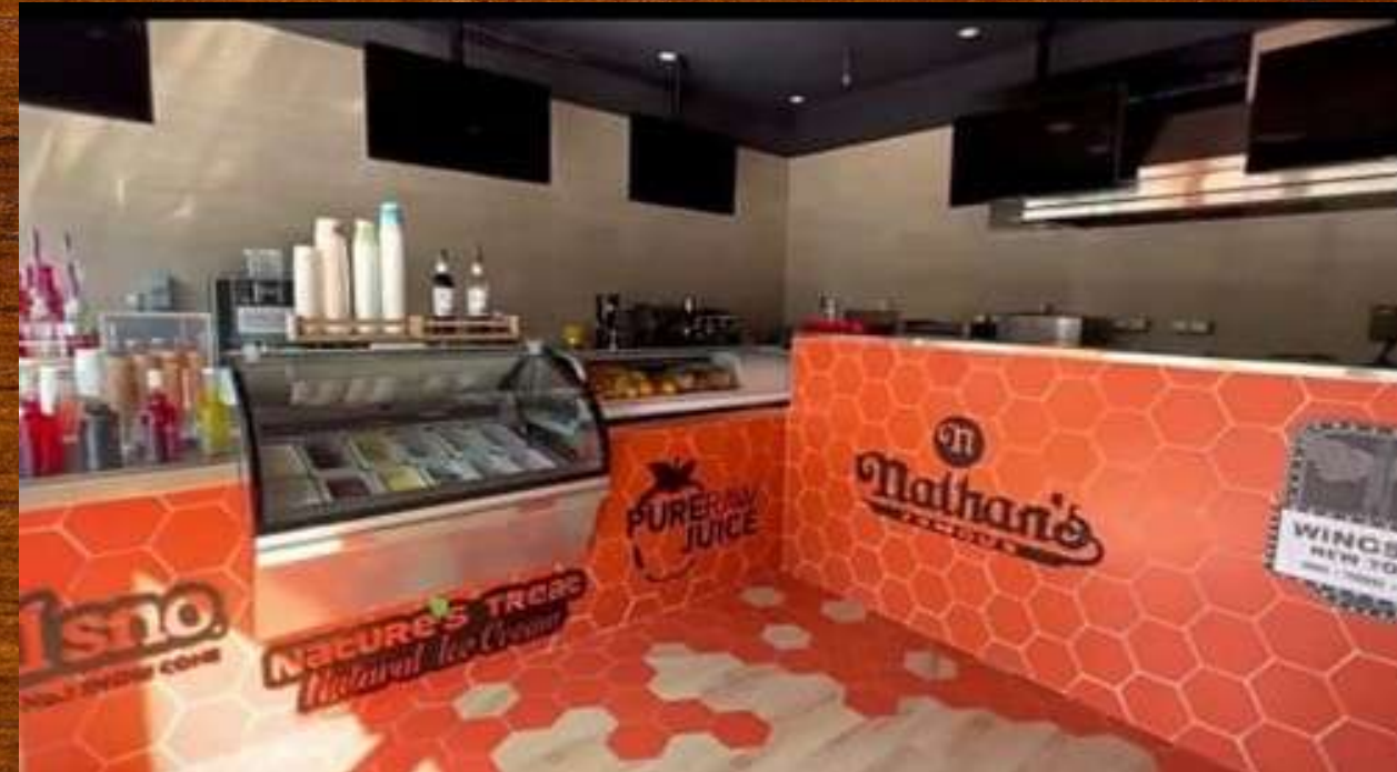
ISLAND TREAT - ATLANTIS