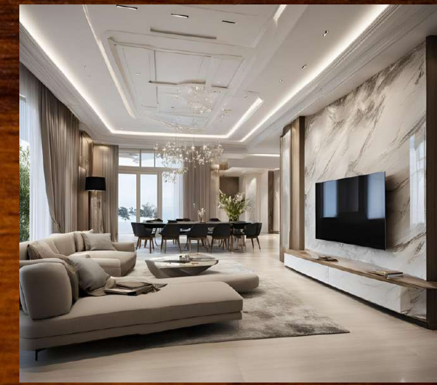
VILLA - UAE