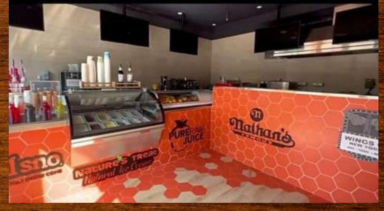
ISLAND TREAT - ATLANTIS