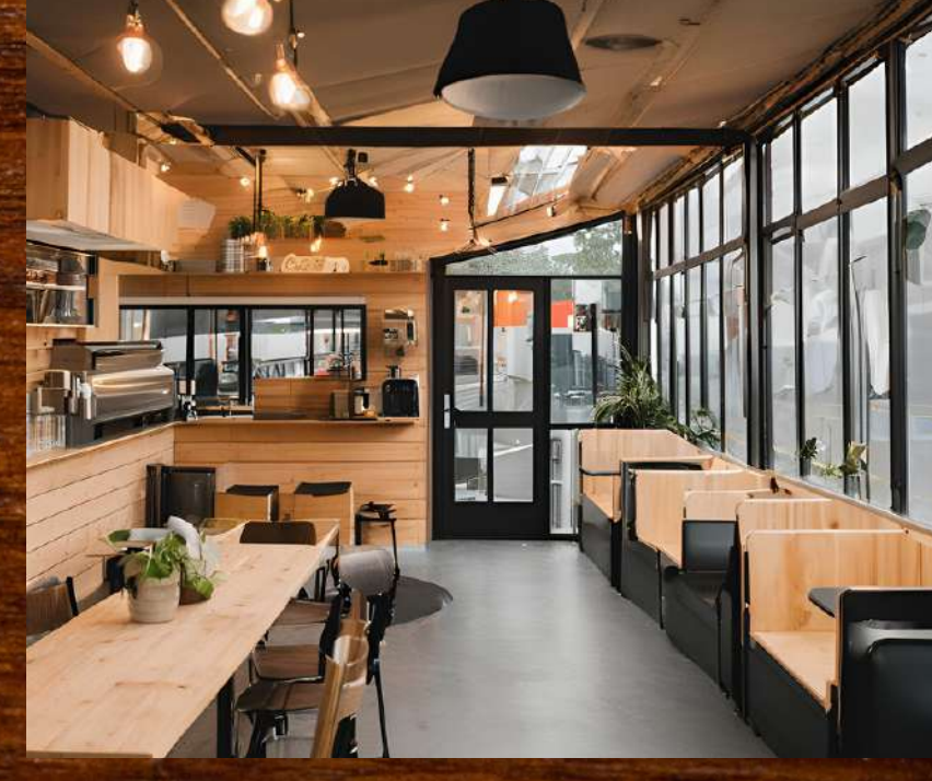
CAFE - UAE