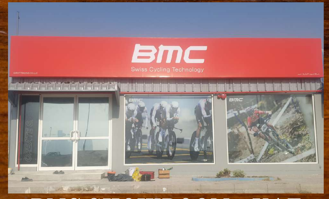
BMC SHOWROOM - UAE