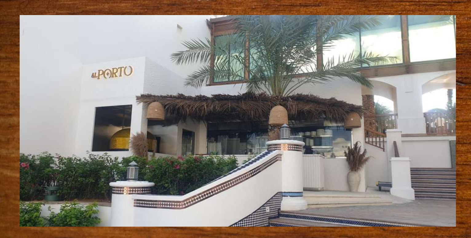
PARK HYATT - DUBAI